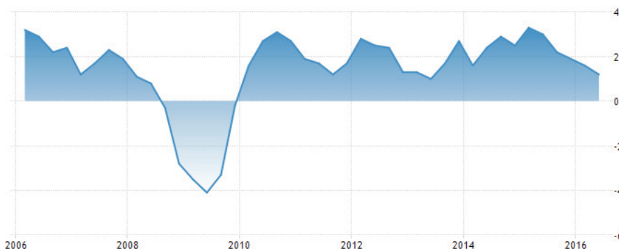
US GDP ANNUAL GROWTH RATE